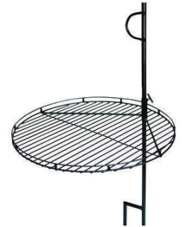
Swing Away Grill

Bringing Family and Friends Together Like Nothing Else Does!