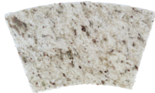
Extra Layers & Colours