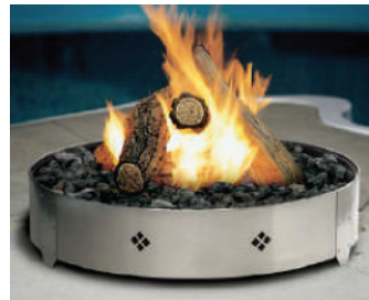
Gas Burner Kits