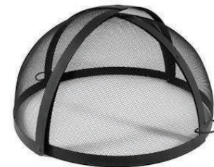
Spark Screen Cover