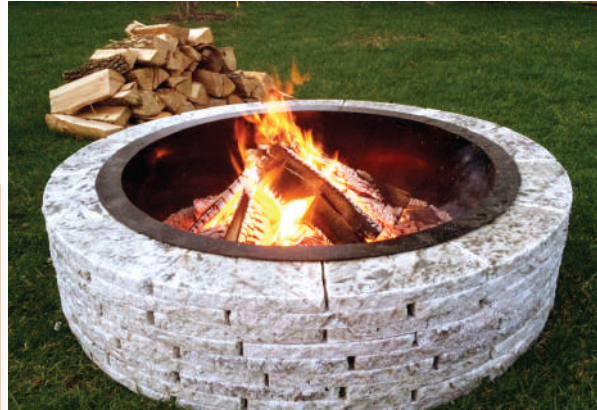
48" Granite fire pit (shown with wood burning kit)