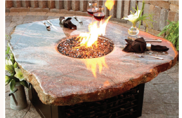
Live-edge Granite Fire Tables (shown with gas burner)

Assembles in 60 minutes or less – Available in Natural Gas, Propane or Wood Burning Kits