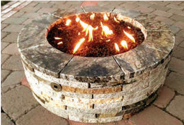
35" Granite fire pit kit (shown with gas burner)