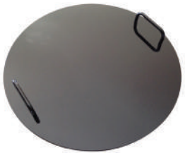
Heavy Duty Topper